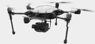
Albatross or Raptor Drone