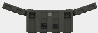
Easy Guard Tether (EG-T)

The system consists of 3 main components: