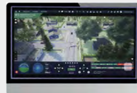
Easy Remote Monitoring Software (ERMS)