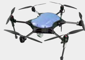
Kestrel or Osprey sUAS