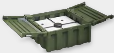
Easy Guard (EG)

The system consists of 3 main components: